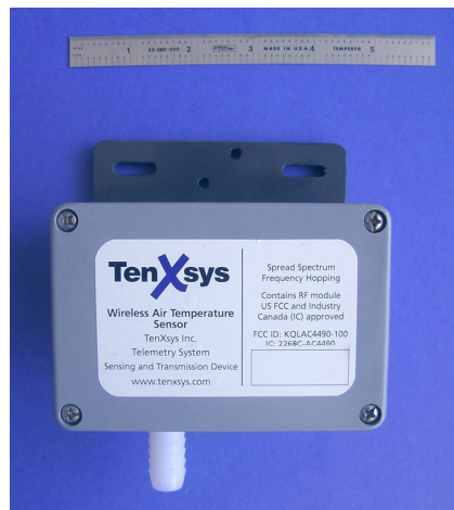
Figure 1: TenXsys Wireless Air Temperature Sensor